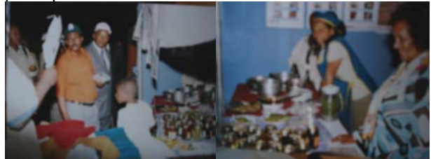
Mums for Mums demonstration and visitors at the Exhibition

Mums for Mums would like to thank the Food & Agriculture Organisation (FAO) for funding our participation