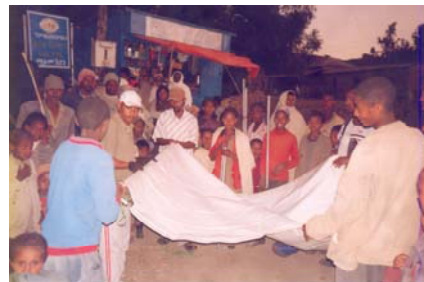
Preparation for Video shows to the community

With these heartening numbers attending the program, it is hoped that the campaign has raised overall community awareness about HIV-AIDS, Reproductive Health and the Mums for Mums project across the Woreda.