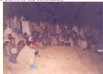
People watching the show