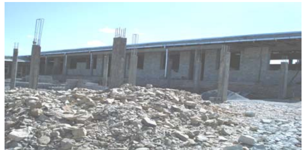
The new skills training wing:

In the meantime, anticipating the good things to come in the new wing, the knitting training has moved out of the yellow container into a bigger grey container. This grey container, a gift to Mums for Mums by TDA (Tigrai Development Association), had previously sat on the new site storing building materials.